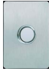
Figure 2: Hall Call

In the event of a building power failure, the door system is provided with a temporary power back-up system to continue the opening operation for a number of times. On resuming normal building power, the back-up system will turn OFF and begin automatic recharging.