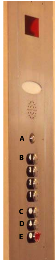
Figure 1: 4 Stop COP

The COP emergency light remains ON in the event of a main power failure. The emergency light uses a Battery Back-Up system with an automatic recharger.