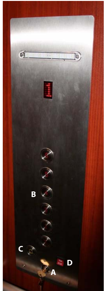
Figure 1: 6-Stop COP

The cab emergency light remains ON in the event of a main power failure. The emergency light uses a battery back-up system.