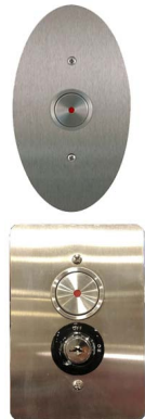
Figure 3: Hall Call

The Landing Door/Gate lock prevents the movement of the cab unless the door/gate is in the closed and locked position. If the door/gate is not completely closed, the cab will not move.