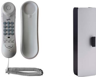
Figure 2: Standard Phone and Phone Box

If the unit has a standard phone, it is located in the cab phone box (see below).