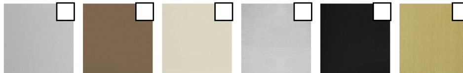
Clear Anodized Aluminum