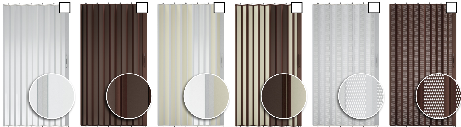
Clearfold [clear acrylic panels]