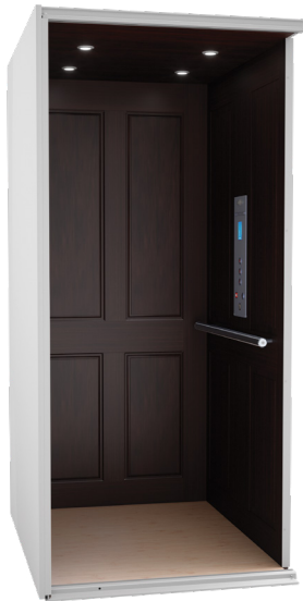
Cherry Hardwood – Walnut