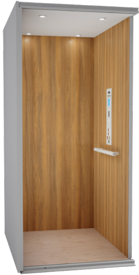
Karuna Ash Melamine