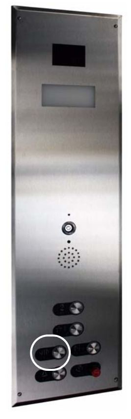
Figure 3 Door Open Button

When the elevator is at a landing level, the Two-Speed Horizontal Sliding Doors or Automatic Pro-Door can be opened by pressing the Door Open button. Normally the doors will have opened and already closed automatically. The Door Open button allows the door to be reopened.