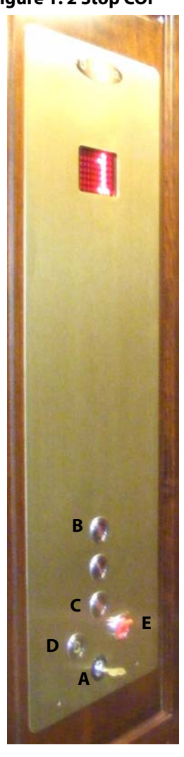
Figure 1: 2 Stop COP

A single handrail is mounted on the Cab Operating Panel side of the cab.